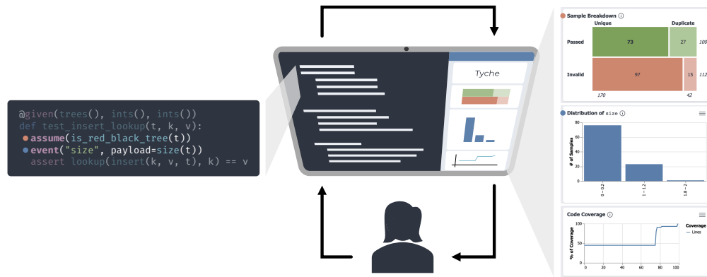
Fig. 2. Tyche interface.

Free and reflective generators are primarily theoretical contributions; they connect ideas across areas of computer science and provide a foundation for future work. Concretely, these abstractions continue to inform my ongoing work on automatically synthesizing and tuning random data generators (see below ).